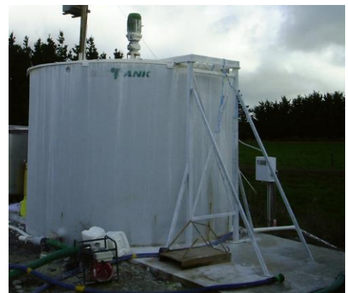
Sump being utilised as a fertiliser mixer